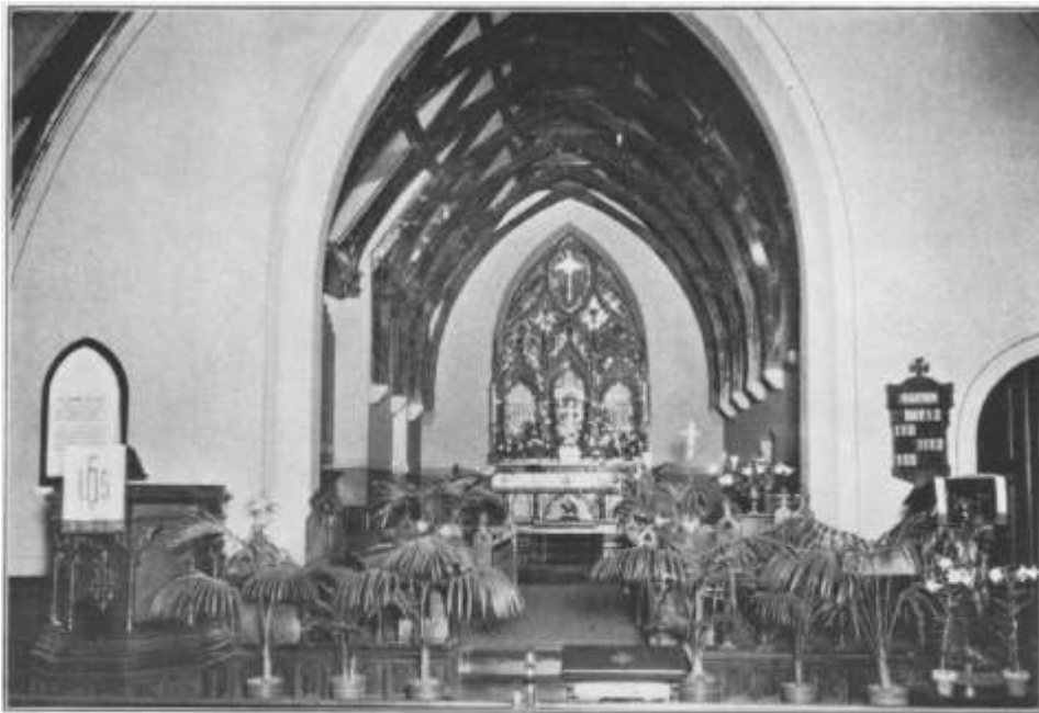
VIEW OF PRESENT CHANCEL.